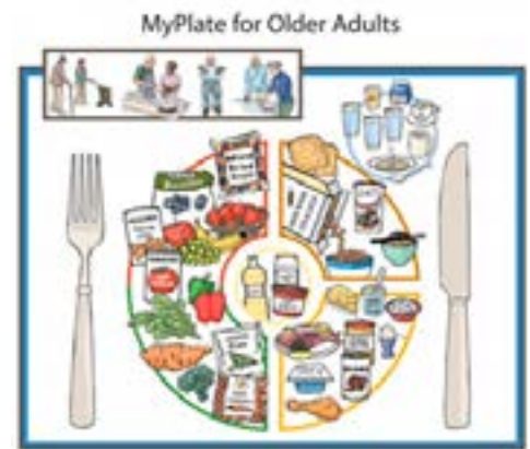
Figure 1: Go to the Web sites http://hnrc.tufts.edu/my-plate-for-older-adults/ and www.choosemyplate.gov to find your personalized plates for good health.